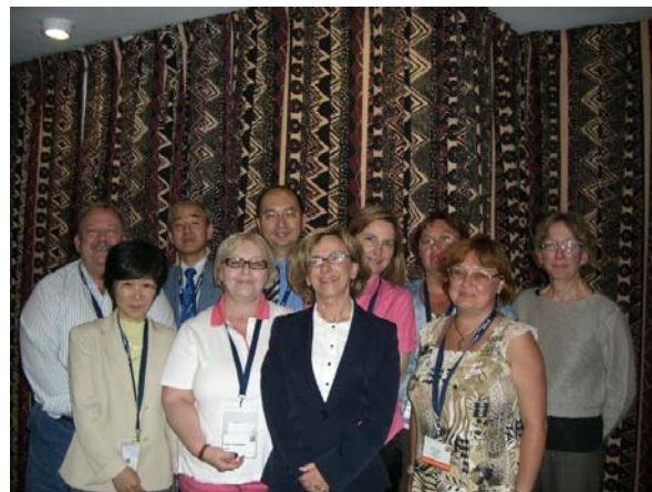
PAC Directors Meeting, Durban

See you in Québec: voilà mon souhait; très bonne année à tous.