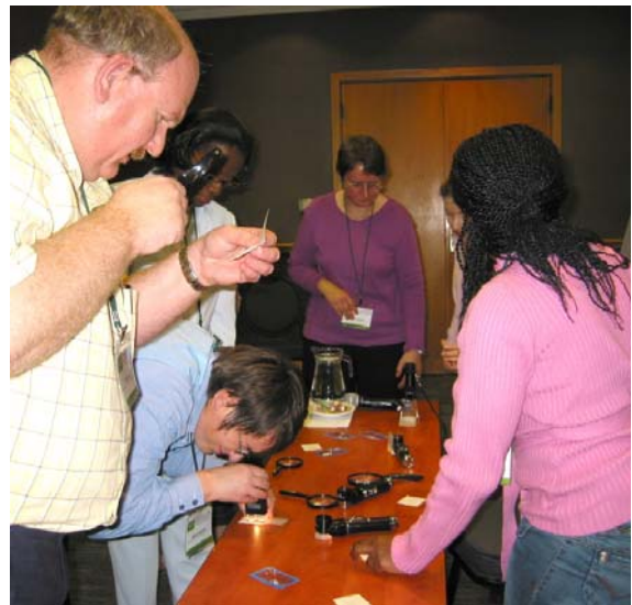
Examining pests at the satellite conference