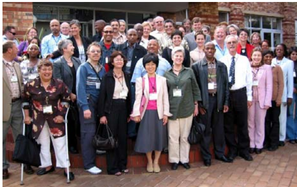
Satellite meeting attendees and presenters