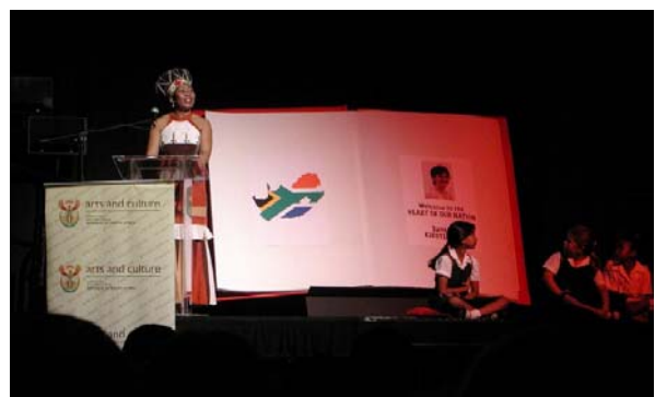
Opening Ceremony, Durban