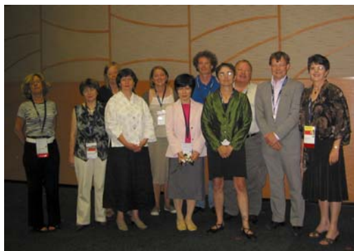
Preservation and Conservation Standing Committee