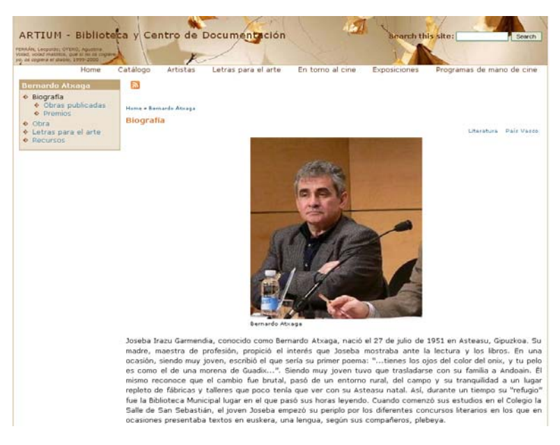
Fig. 4. Literature for art: Bernardo Atxaga

On film-making. The museum organises debates and cycles with the aim of going deeper into some of the most representative films in the history of the cinema. This section includes dossiers on programmed films, providing their technical specifications and synopsis, their context within the history of film-making, information about the director and actors, and documentary resources available.