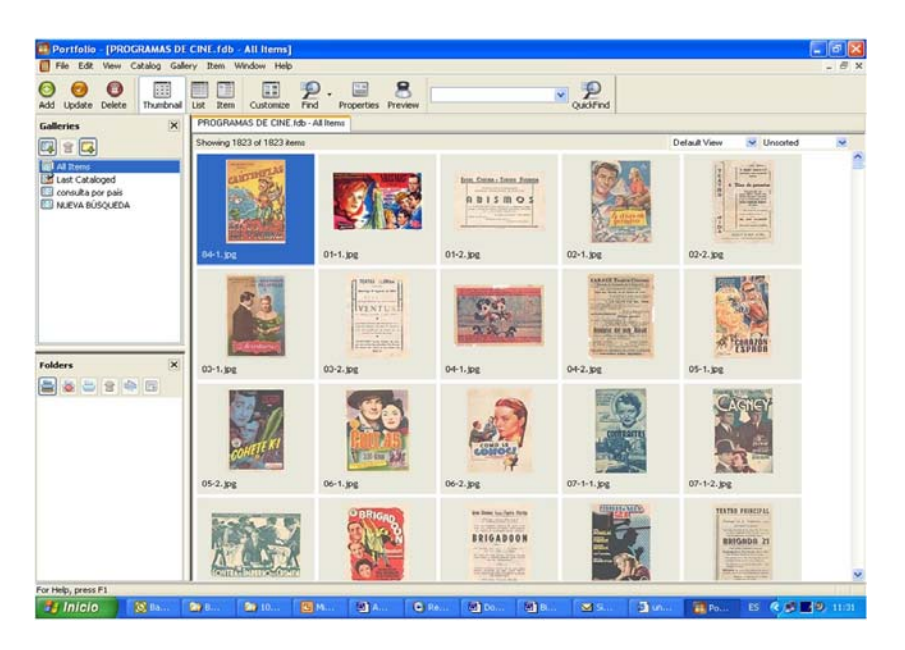
Fig. 7. Film programmes

Cinema programmes. The library has about a thousand film programmes dating from the 1930s to the 1960s. These have been documented, digitalised and included in the image database. We aim to place this information at the disposal of all of our users.