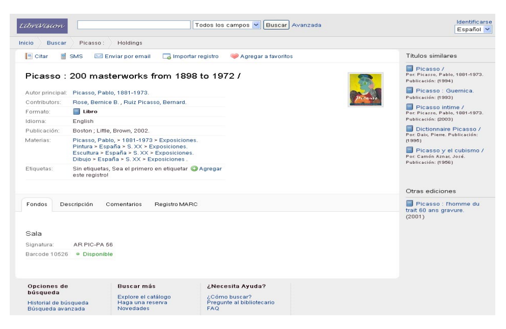
Fig. 2. Example of a catalogue entry

We are working on a catalogue that is accessible online, meets the demands of the social web for digital material, and is generally adapted to the new forms of user interaction through localisation and information management.