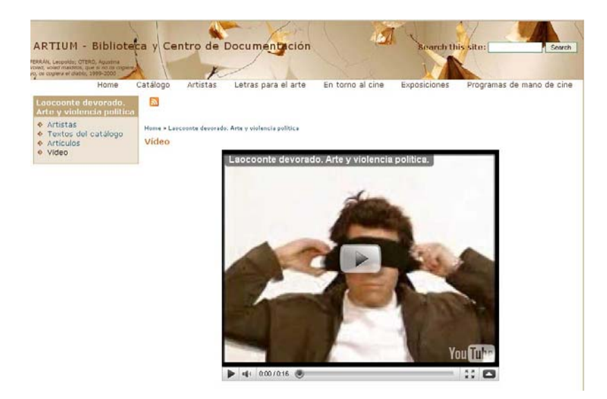
Fig. 12. Video inserted in one of the dossiers