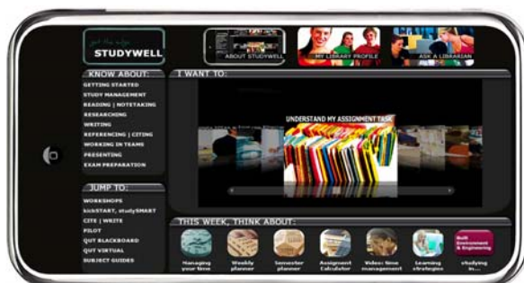
Home page of Studywell

Academic staff have also responded enthusiastically to the new resource, by integrating it into their teaching and learning strategies.