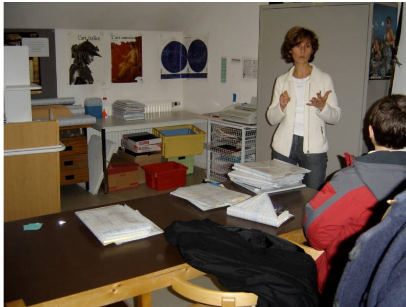
Presenting a public service