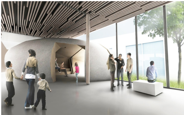
Multimedia library -1600 m 2