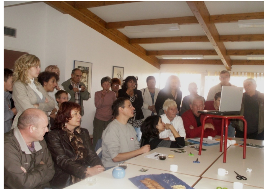
People working on a project for the city.