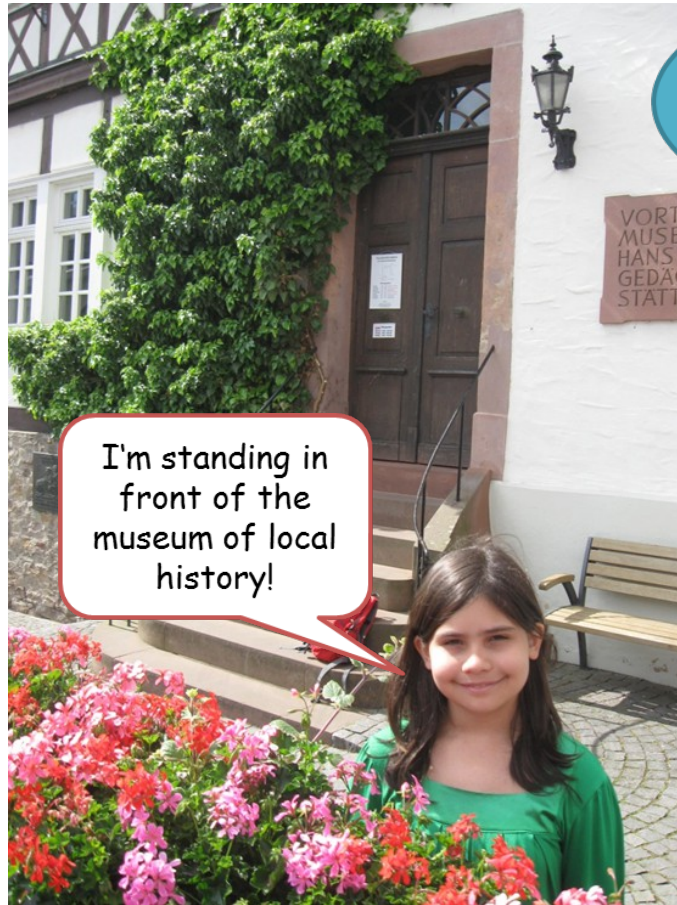
I'm standing in front of the museum of local history!