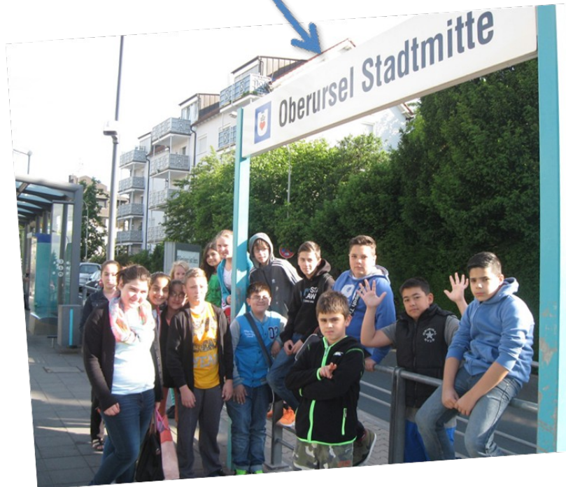
the german project class