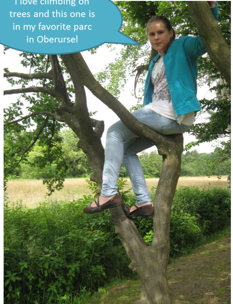
I love climbing on trees and this one is in my favorite parc in Oberursel