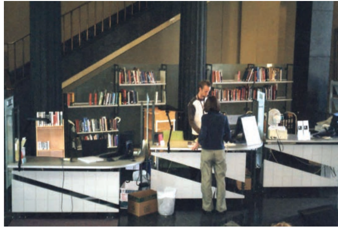
(Right) Oslo Public Library Desk, Norway.