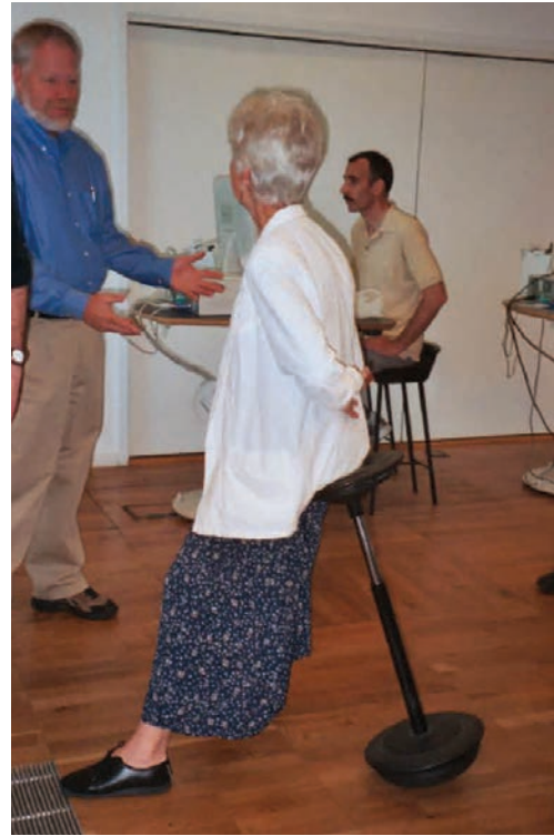
(Left) Swedish Round Information Desk. (Above) Stool for round information desk.