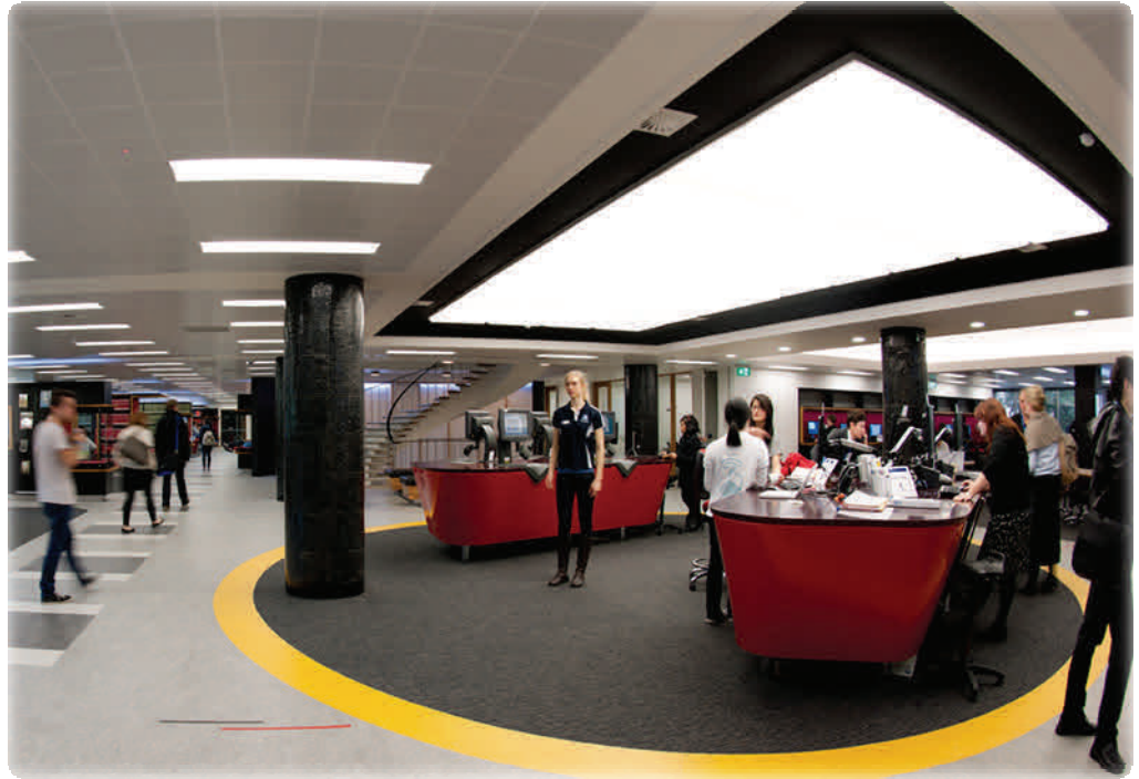
Service Desk at Baillieu Library, University of Melbourne, Australia