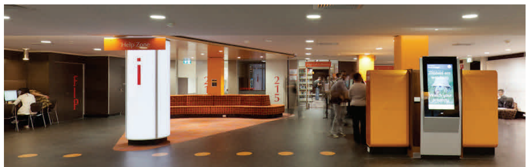
Help Zone at the University of New South Wales, Australia.