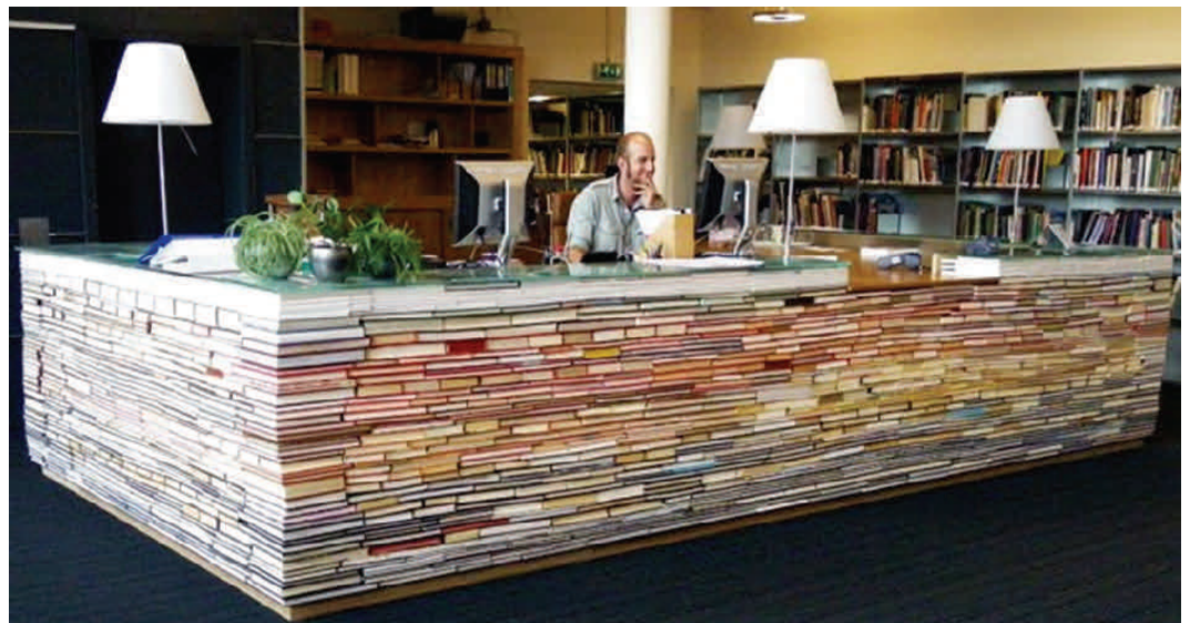
Service desk of the Architecture Library at the University of Delft, Netherlands.