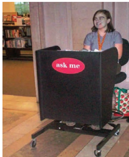
Ask Me Desk.

As our print collections decline, our library spaces are being transformed into learning spaces for both collaborative and individual study. At the same time we are seeing a transformation at our Library entrances – the service desk is also being transformed. As shown in these images no one style is dominant – however, there are common themes of removing the desk as a “barrier”, creative and minimalist design, and flexibility.