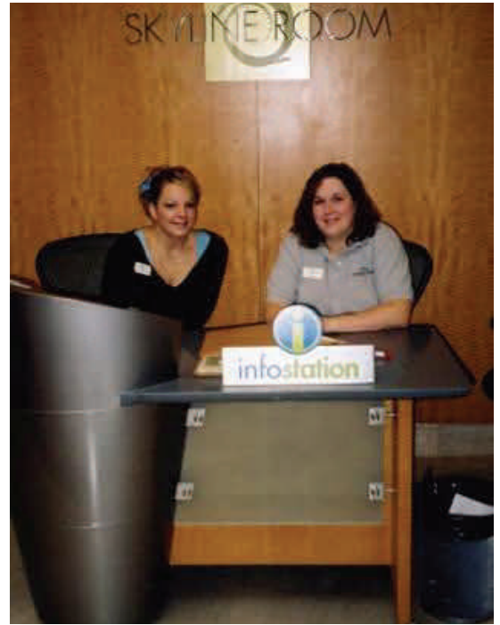
InfoStations at the City of Cerritos Library in the US.