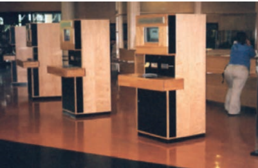
(Above) Circulation Desk in the background with the self-check stations in front at the Oslo University in Norway.