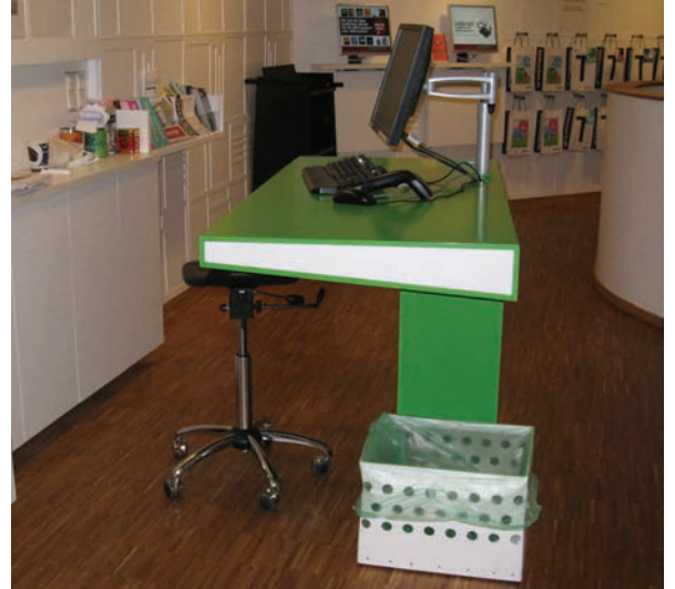
Sture Bibliotek, Stockholm – Sweden