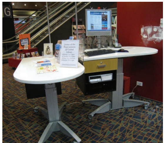
(Above left) Library and IT Help Desks in the William T. Young Library, University of Kentucky (US) where students can receive help with library research or technology issues. (Above right) Auckland Public Library, Auckland, New Zealand .