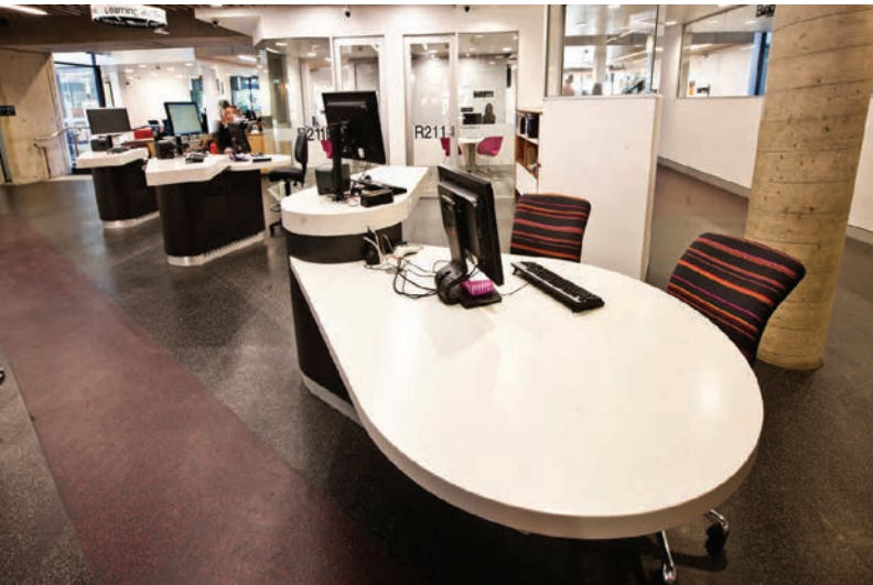
Learning and Research Desks at Queensland University of Technology, Brisbane, Australia.