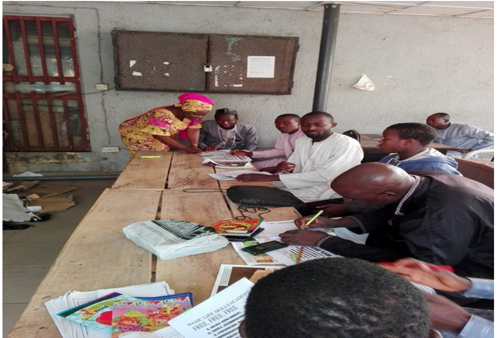
By Olochi Iche Kalu

Basic life skills Academy at National Library of Nigeria. (Open space) Interestingly learning is taking place.