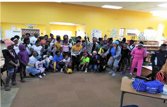
Participants of African Child Day 2019 Program at Eastwood Library

The day aims at raising awareness for the situation of children in African, and on the need for continuing improvement in education. It encourages people’s spirit of abundance to share something special with a child in Africa.