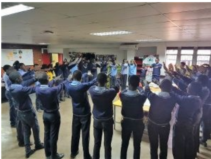
Zambian school children participating in programs to mark Day of the African Child.