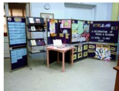
An overview of the World Book and Copyright Day exhibition at DISTED Library.

The exhibition was a success as it had a large number of visitors from the DISTED community and it exposed them to complex world of information related to books and reading. It also raised the visibility of the Library in the College.