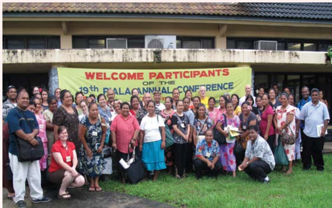
2009 PIALA Conference participants.

The Pacific Islands Association of Libraries, Archives, and Museums (PIALA) is a Pacific regional association established in 1991 to address the needs of librarians, archivists, and curators in the Pacific, with special focus on Micronesia. Micronesia, meaning “tiny islands,” comprises the Republic of the Marshall Islands,