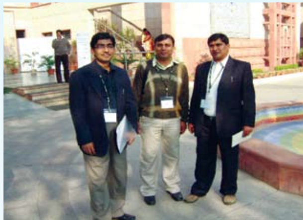
Delegates at the ICoASL 2008 Conference

“ICoASL 2008 – Shaping the future of Special Libraries: Beyond Boundaries” was organised by SLA-Asian chapter in association with Society for Library professionals (SLP) and Indian Association of Special Libraries and information Centers (IASLIC) at India Islamic Cultural Centre in New Delhi, India from 26–28 November 2008.