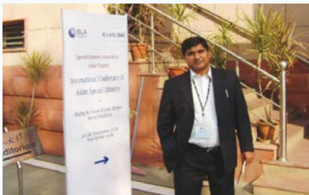
Author at the ICoASL 2008 Conference

The conference was attended by more than 300 delegates with delegates from different parts of India,