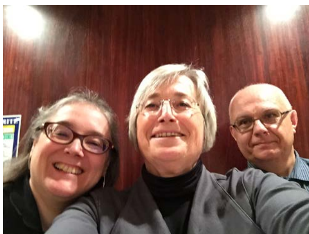
Caption: CEG members selfie!

The responses came from 13 different countries, as well as from multi-national or international groups.