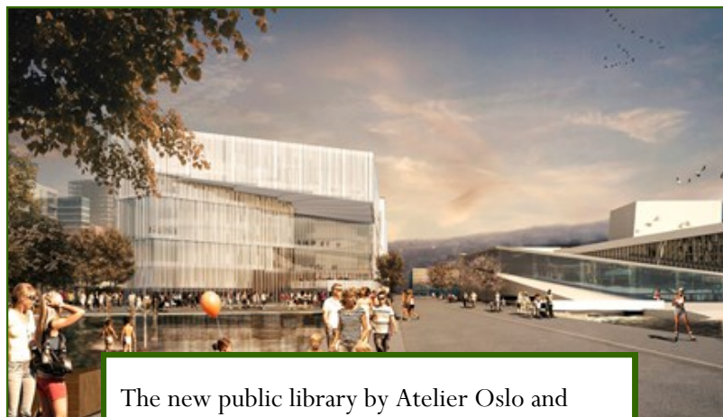
The new public library by Atelier Oslo and Lund Hagem architects

the need for new ways of thinking about cataloguing. So why don't we wait for the library standards for linked data cataloguing that are bound to come sooner or later? Well, first of all there is the suspicion