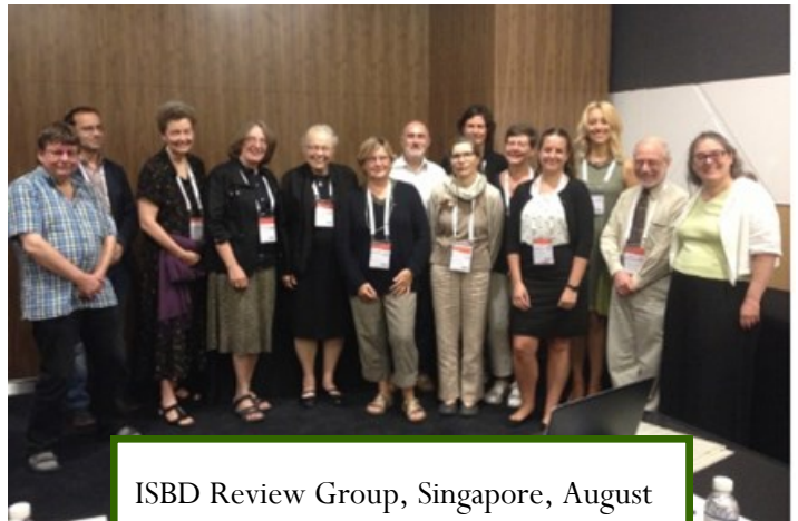
ISBD Review Group, Singapore, August 2013

The ISBD Linked Data Study Group meeting in 2014 continued the work on the ISBD/FRBR namespaces alignment, RDF representation of ISBD resources and use of ISBD classes and properties in library linked data triples, and ISBD application profile. The latter two involve issues to be resolved before designing the planned Guidelines for use of ISBD as linked data ; discussion paper will be prepared for the August meeting. Relationships and future alignments with other namespaces was also discussed, specifically UNIMARC for bibliographic data namespaces, FRBRoo and PRESSoo, identifying these as tasks to be included in the plans for the next year activities.