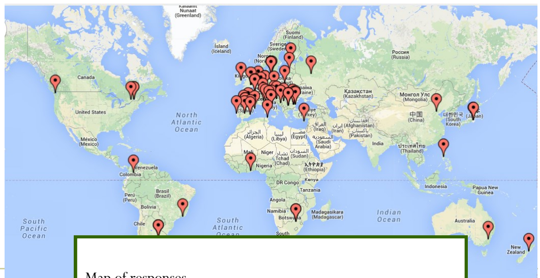
Map of responses

The organisations were asked whether they intend to continue to use their current