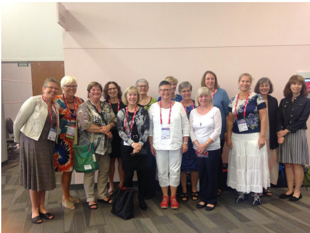
Standing committee meetings participants