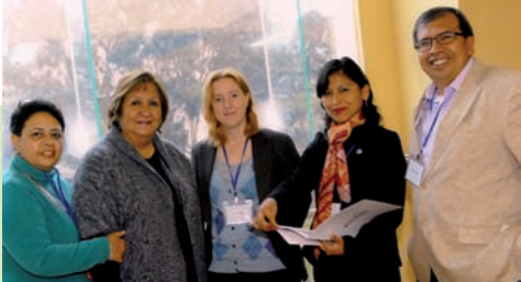
Peru project team met in June

The Peruvian College of Librarians (CBP), is a professional body which adheres to Government requirements. The Professional College was created in 1990 and represents all LIS professionals in the country. It has its national headquarters in Lima.