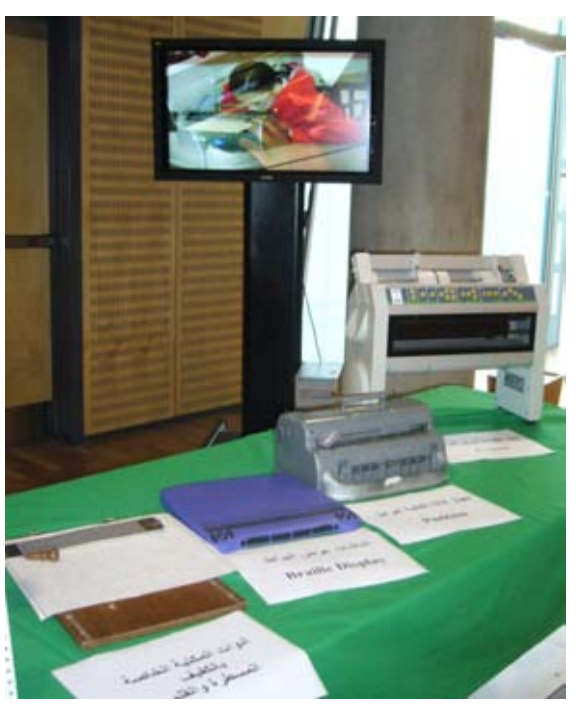
A display of the different tools and devices used for writing and printing braille

their names in braille using the Mountbatten Brailler.