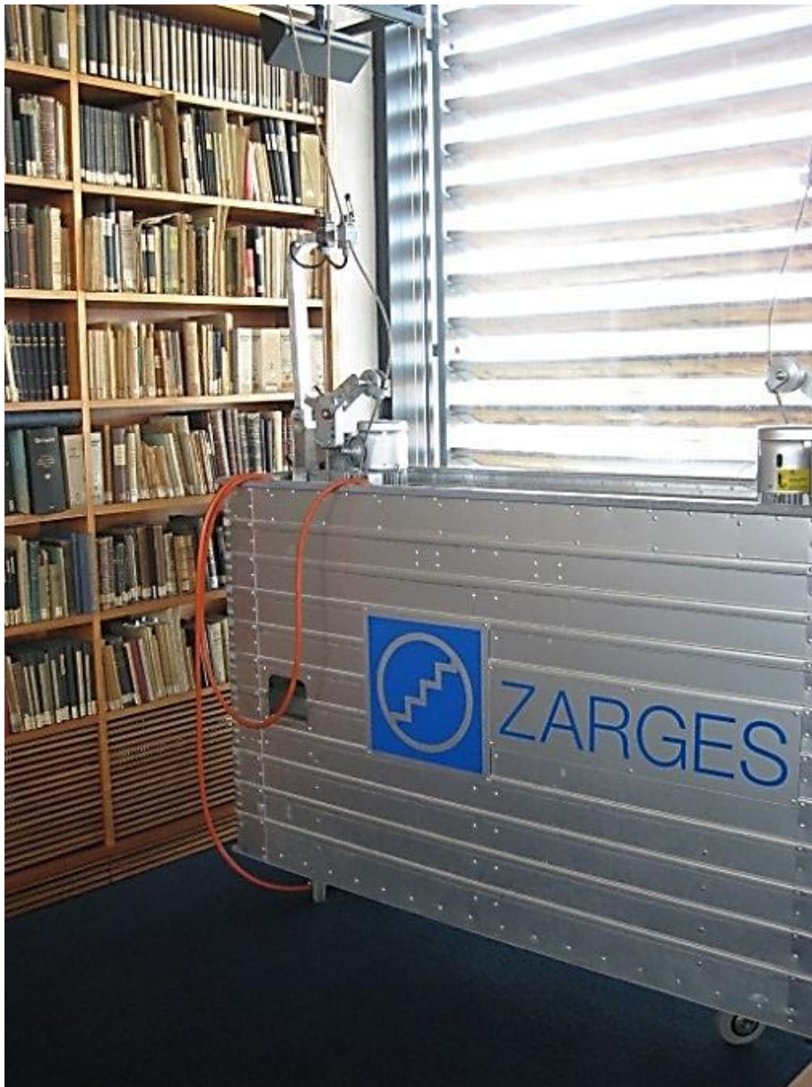
The fixed slats require special window cleaning equipment