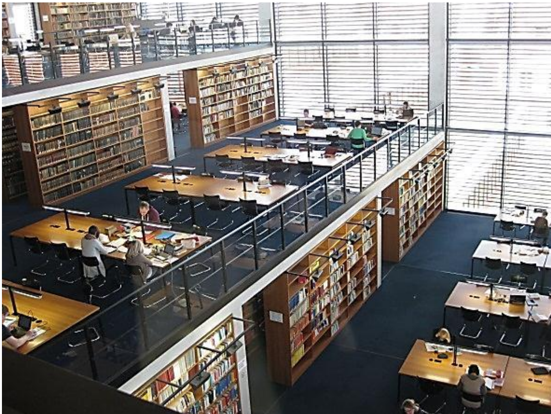
Reading room Die Zweigbibliothek Rechtswissenschaft

The differences in levels have been taken into consideration and a beautiful reading room with terraces is the result. The library opens on weekdays until 5 o'clock in the morning and Saturdays/Sundays from 8 to 24 o'clock.