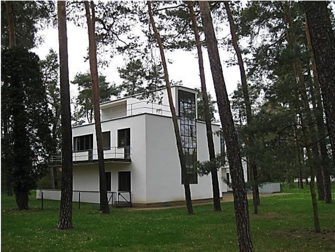
Kandinsky's and Klee's semidetached house