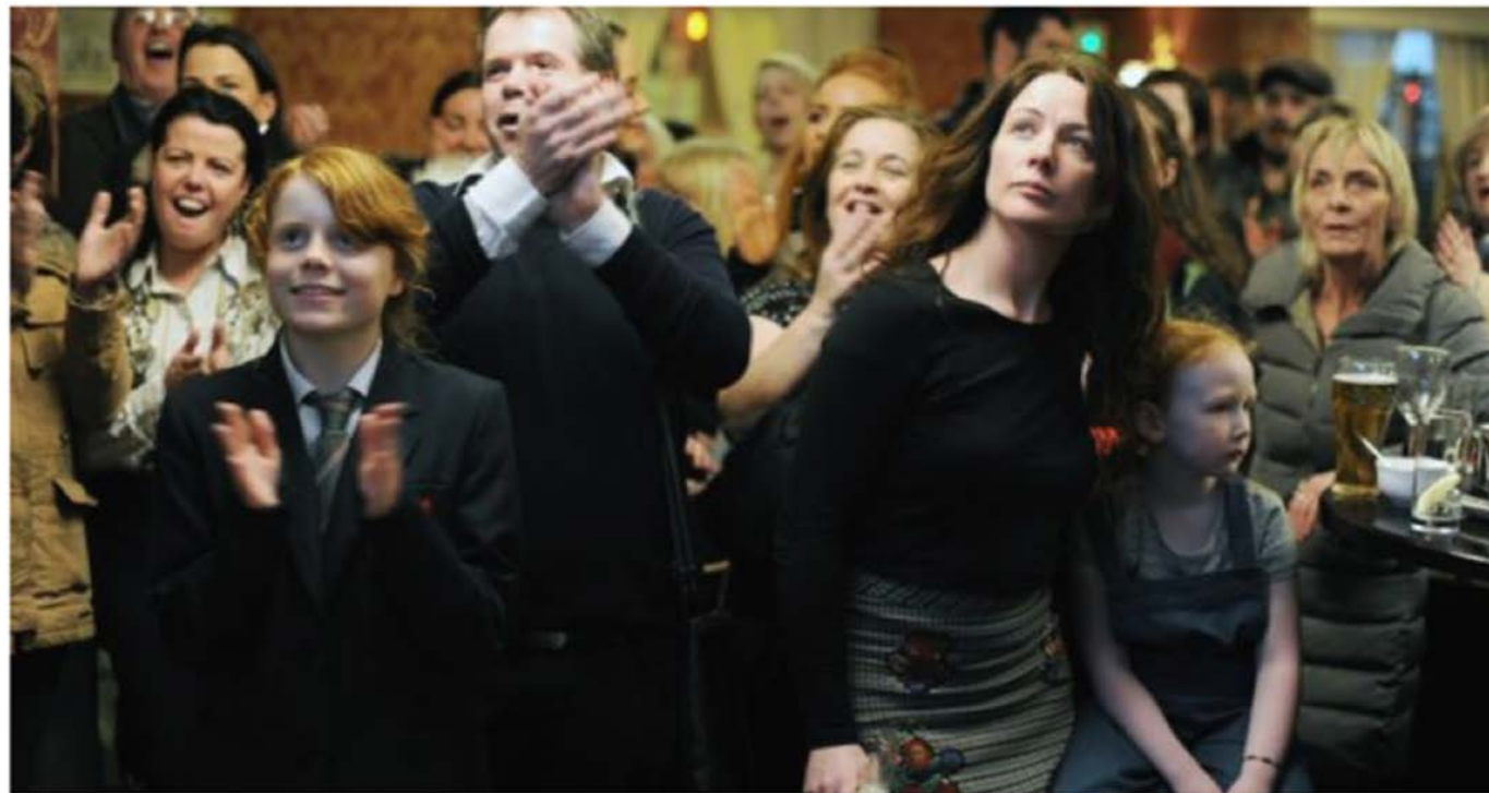
Members of the Traveller community watch the Dáil debate the recognition of Traveller ethnicity, in Buswells Hotel, Dublin.