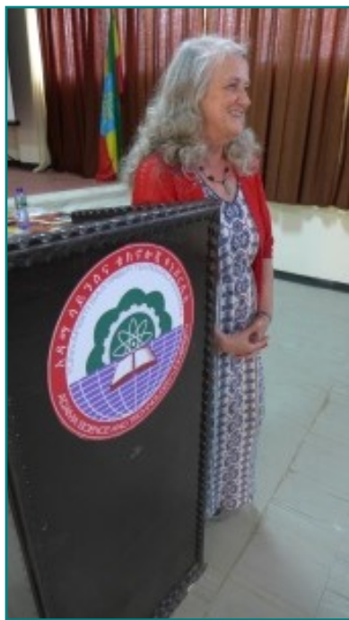
Presenting at Adama Science & Technology University in Adama, Ethiopia