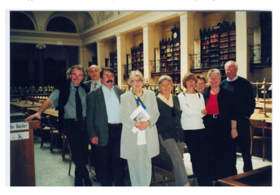
The SC meeting in Vienna From left to right :

What will happen if we slow it down one year? Is there a risk of losing the sponsor?