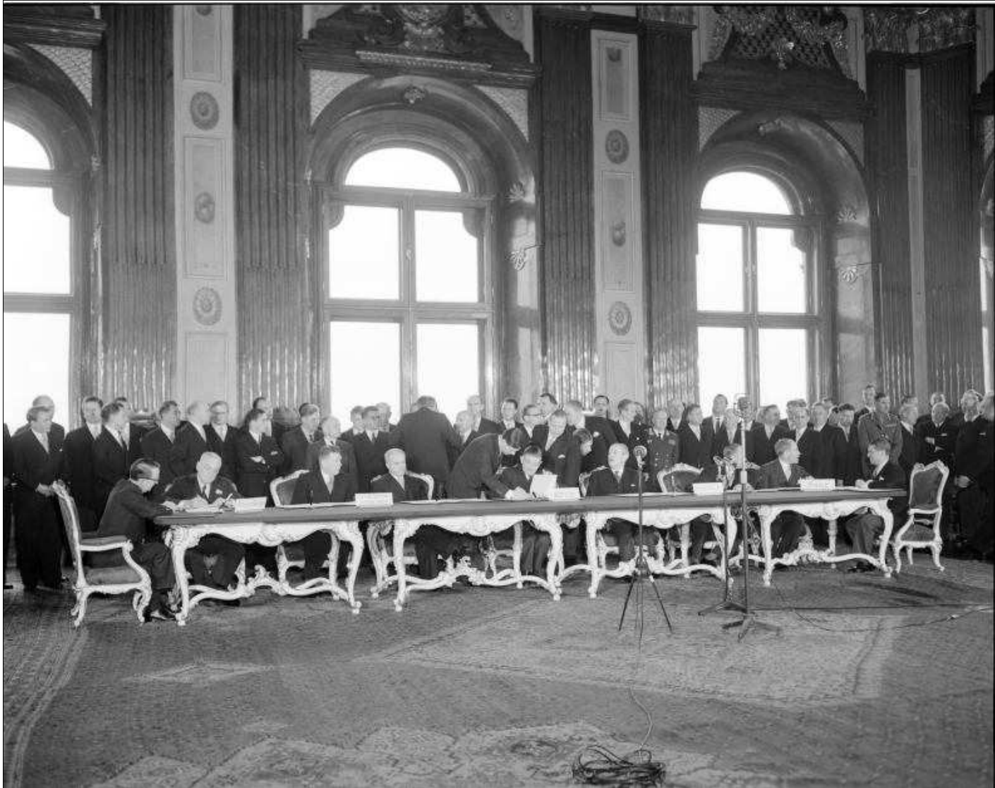
Signing of the Austrian Independence Treaty in Belvedere castle

United States Information Services 15.05.1955