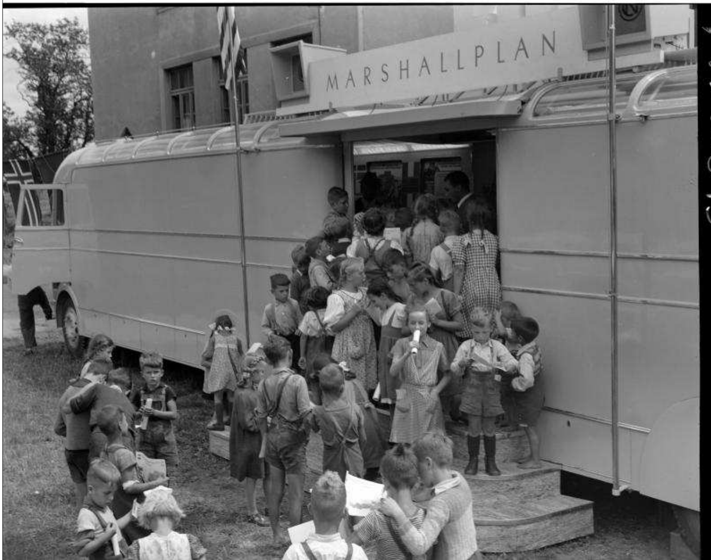
Travelling exhibition of the Marshall plan in Rottenmann (Styria) United States Information Services 13.07.1950