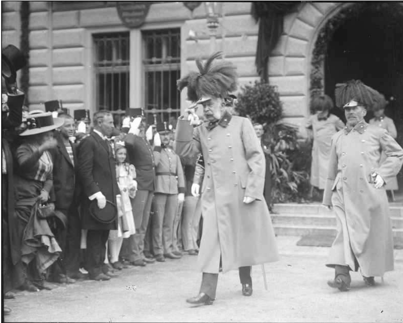
Emperor Francis Joseph on his tour to Bosnia 1910: the Emperor leaving the government building in Sarajevo. 31.05.1910