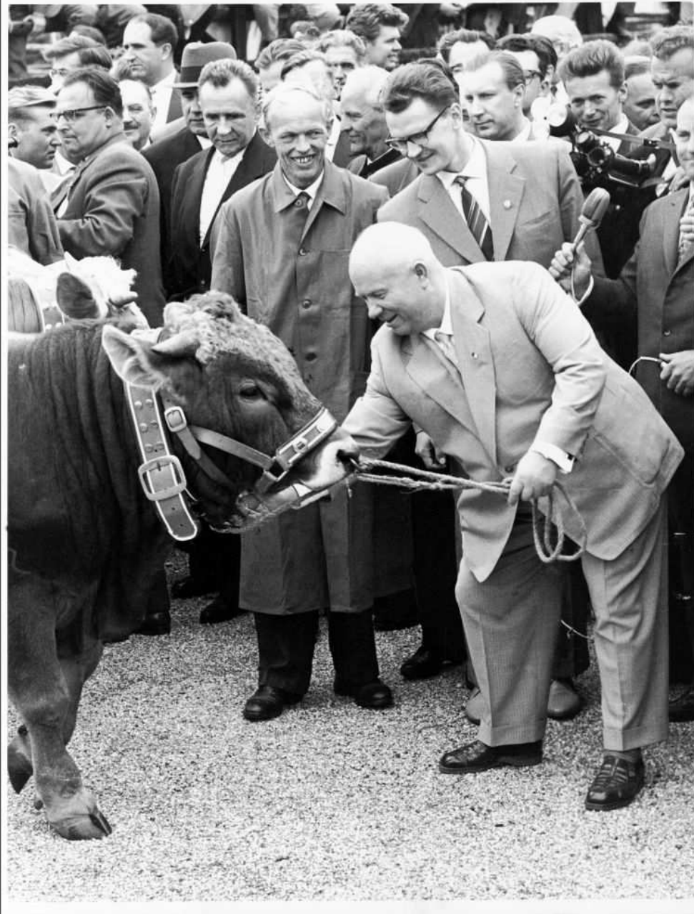
Official visit of the Soviet Prime Minister Nikita Chruschtschow in Austria