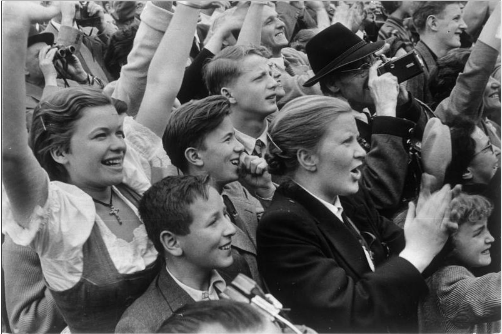
Austrian Independence Treaty: Cheering crowd at the Belveder castle