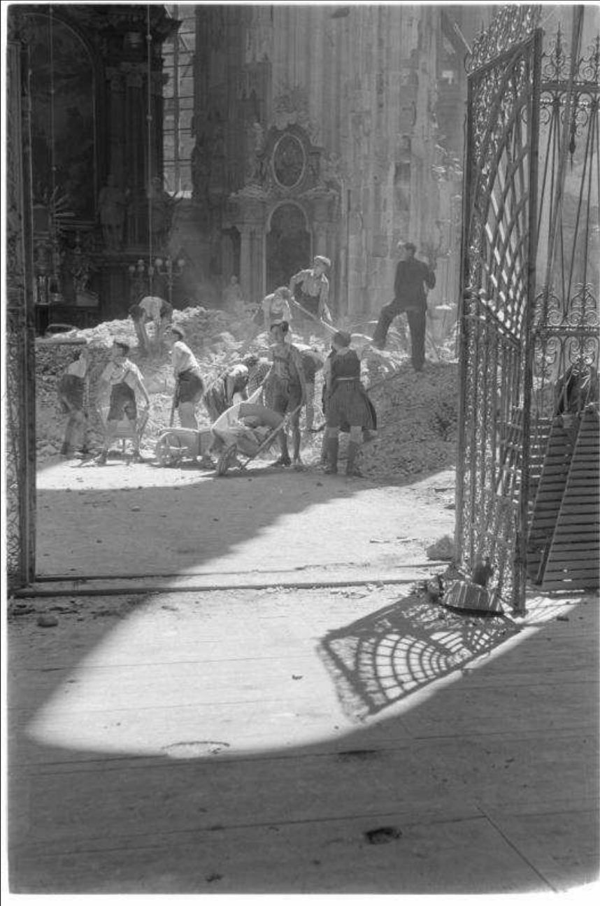
Clearing work in St. Stephan's cathedral