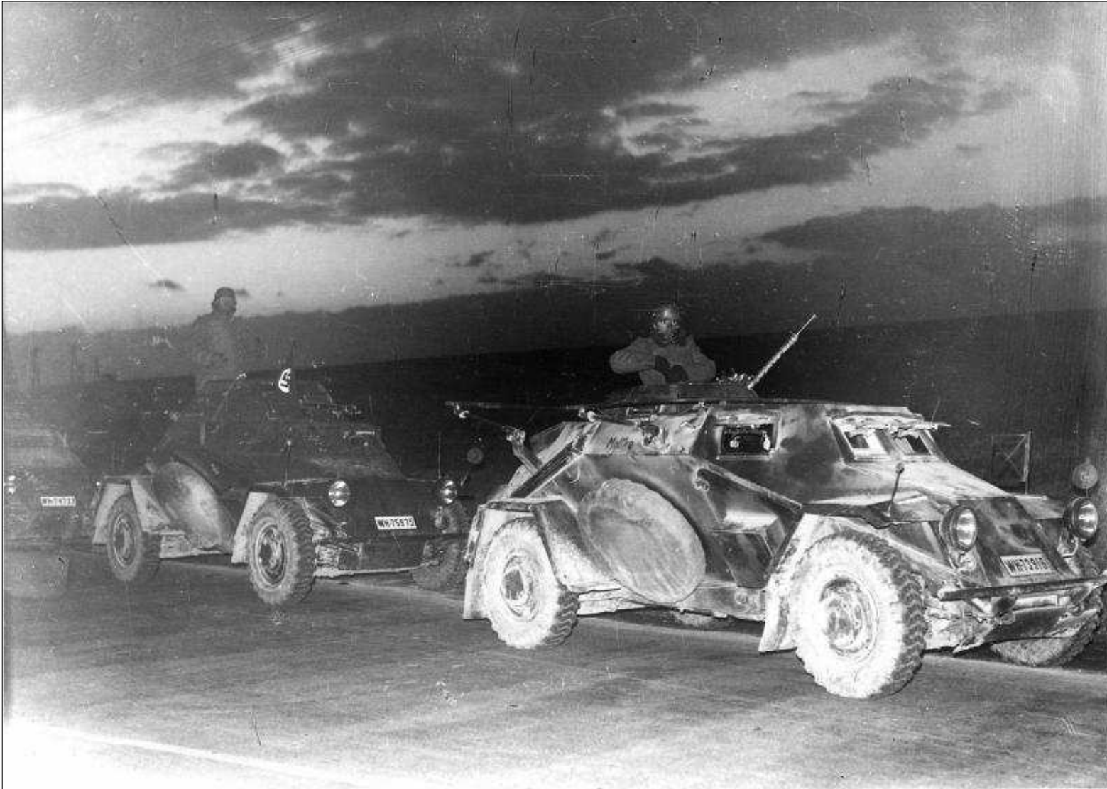
„Anschluss“ 1938. The first German armoured vehicles in Austria 13.03. 1938