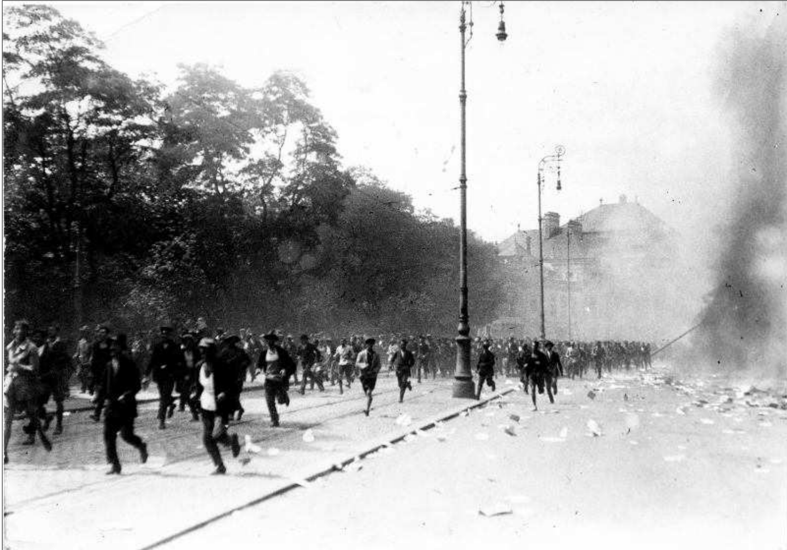
July Revolt 15.07. 1927