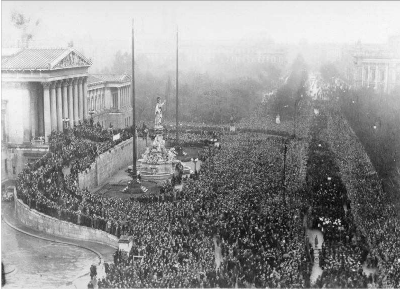
Proclamation of the Austrian republic ???? 12.11. 1918