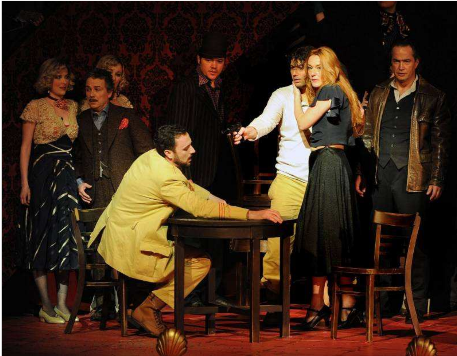
Salzburg Easter Festival. "Carmen" with Jonas Kaufmann and Magdalena Kozena March 2012