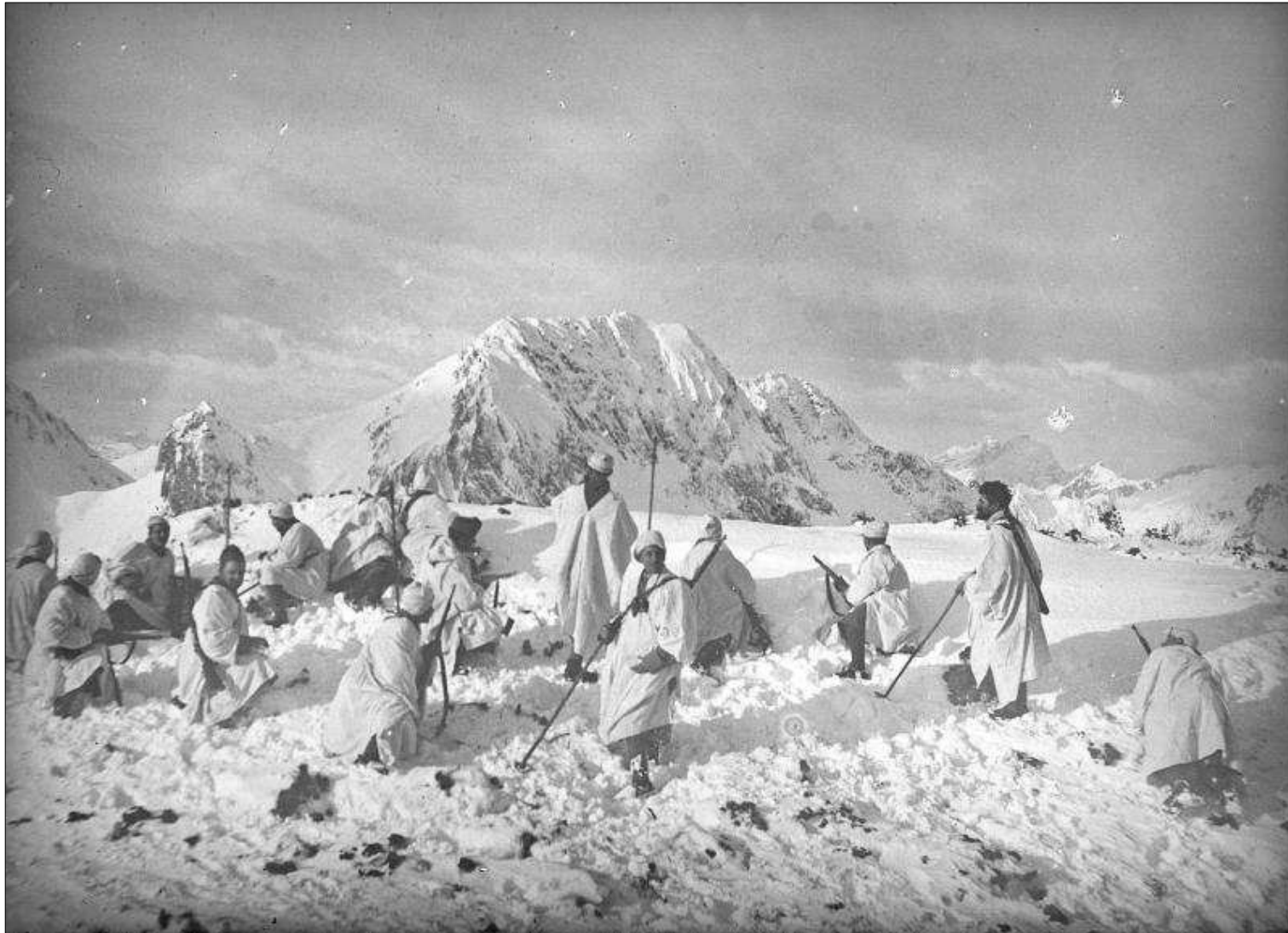
First World War: Patrol at the Carinthian Front 1916/1917 Kriegspressequartier