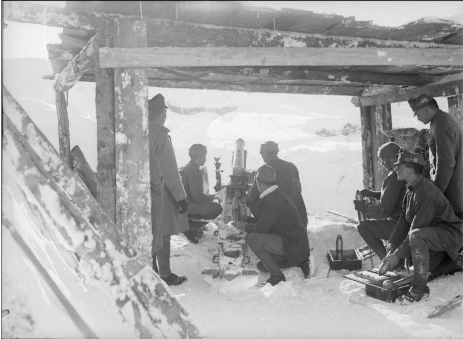
First World War, Carinthian Front 1916/1917 (Rattendorfer Alpe). Shelter for cannons. Kriegspressequartier