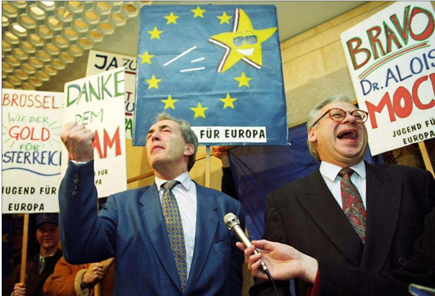
After the successful EU-accession talks: vice-chancellor Erhard Busek and foreign minister Alois Mock 02.03.1994