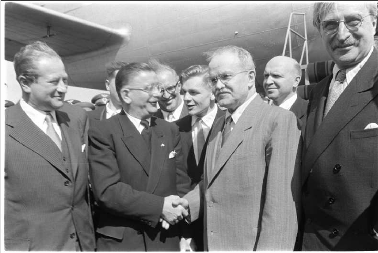
Arrival of the Soviet foreign minister Molotov at the Soviet airport Vöslau, from left: undersecretary Kreisky, foreign minister Figl, foreign minister Molotov and ambassador Bischoff.