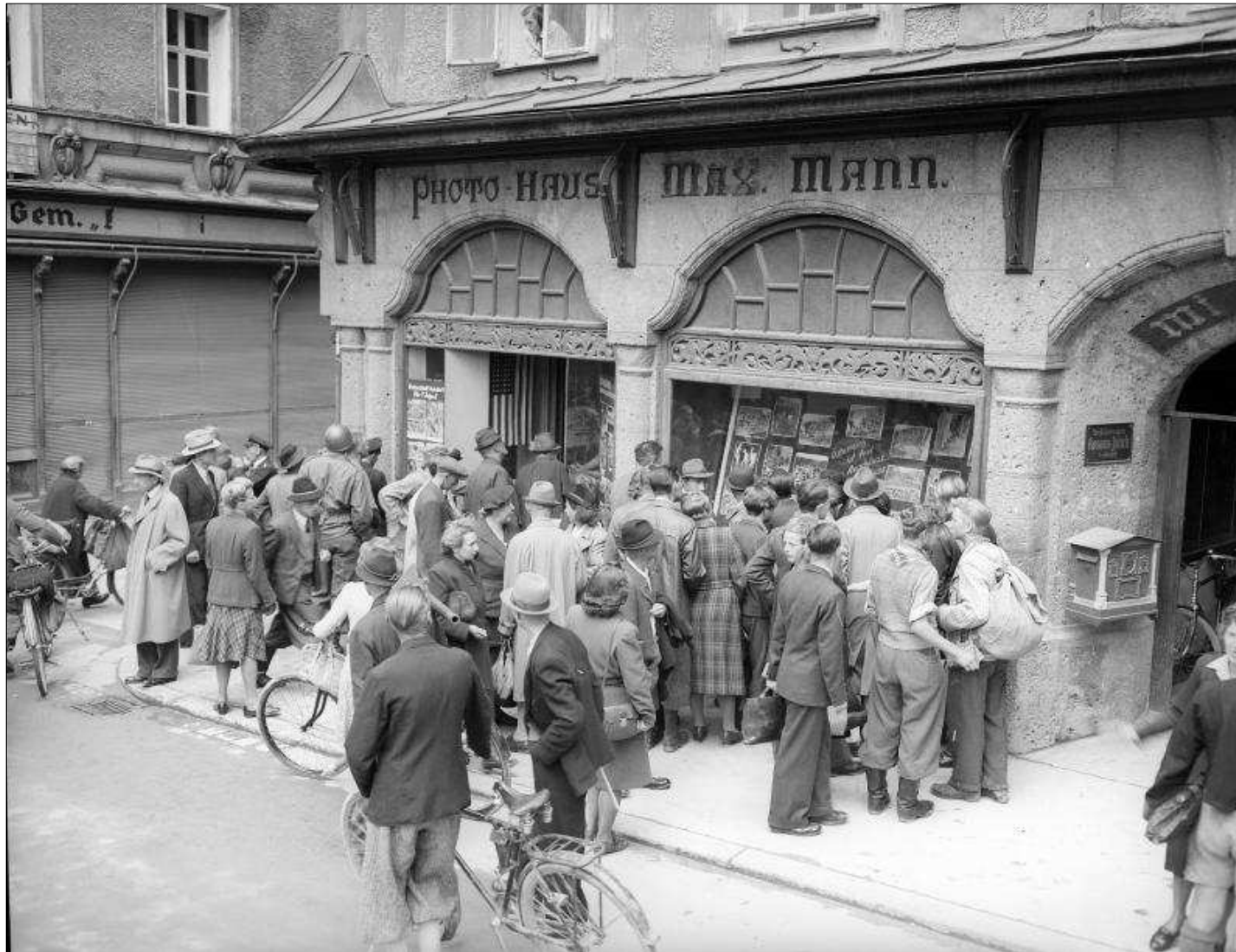
A crowd in front of the display of the Pictorial Section (US Information Service) in Salzburg, looking at pictures of concentration camps United States Information Services 08.06.1945