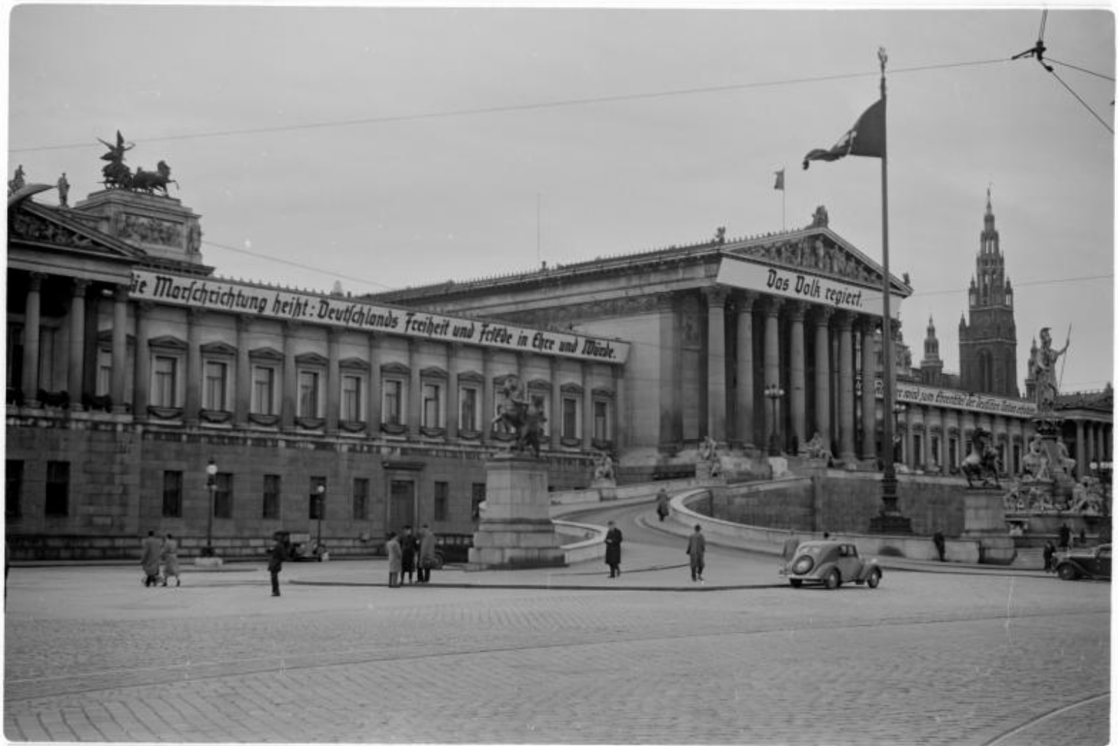
Plebiscite April 1938 (Austrian Parlament) 10.04. 1938