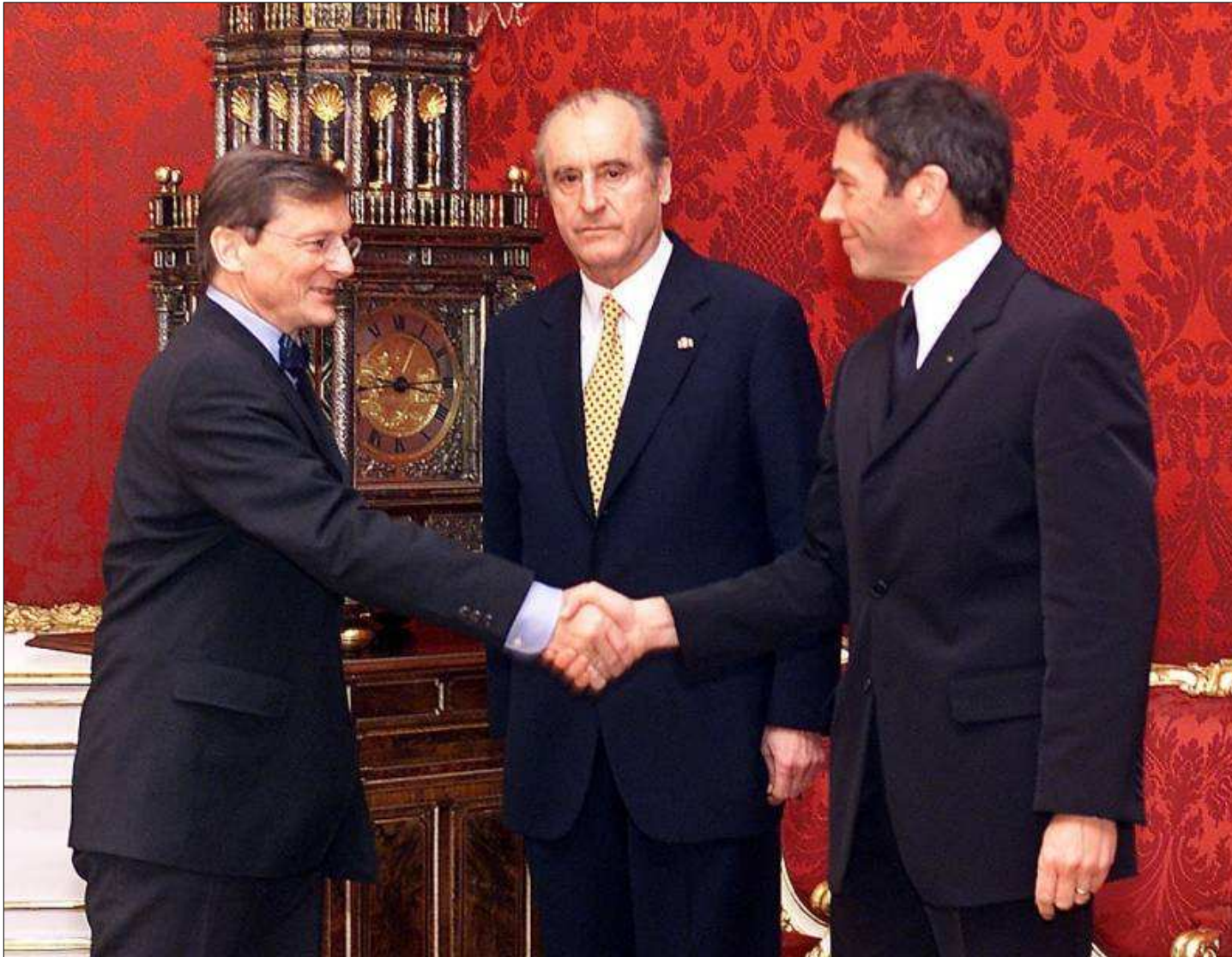
Shakehands W. Schüssel and J. Haider, Federal President Klestil looking stony 03.02.2000