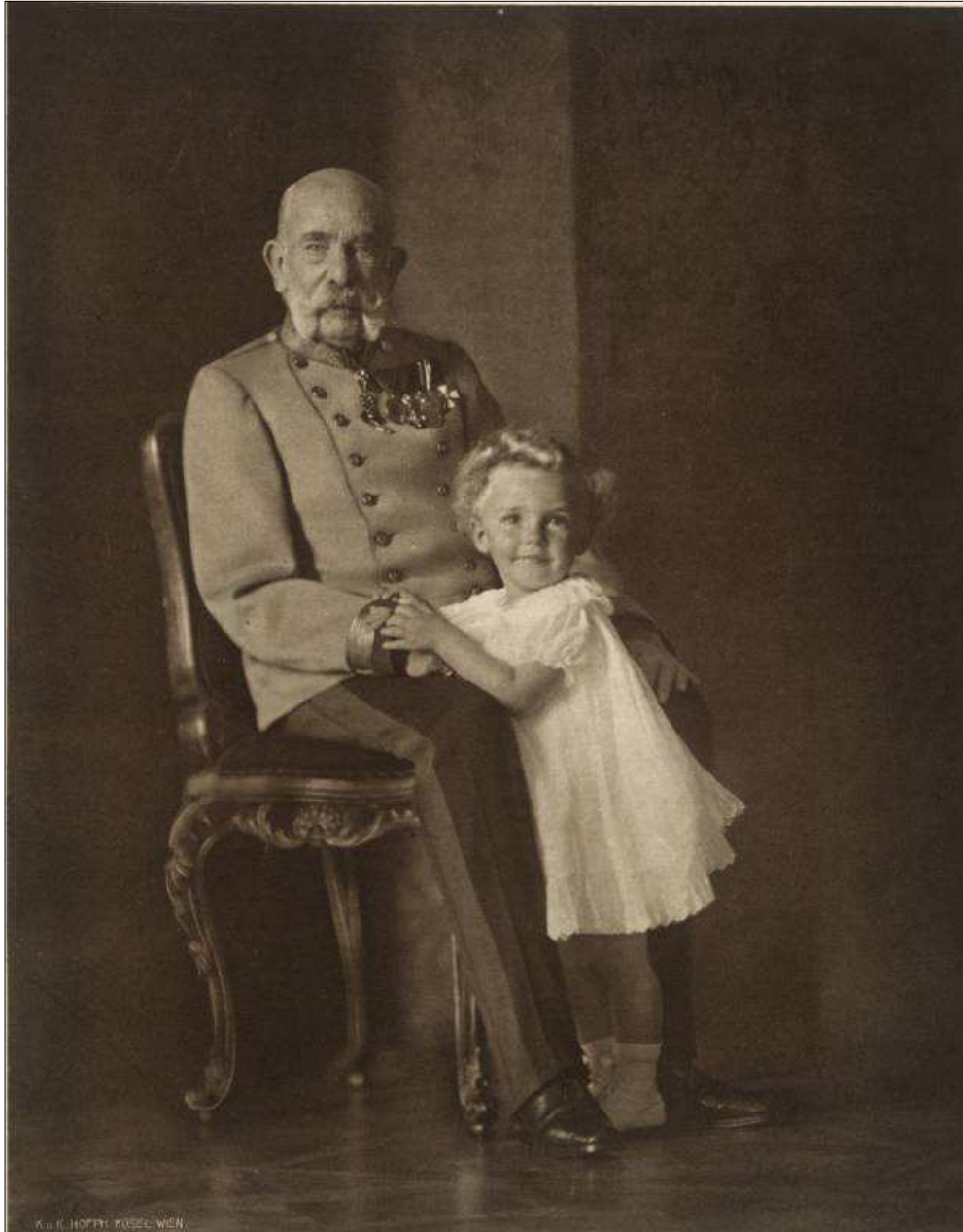
Emperor Francis Joseph with Archduke Otto