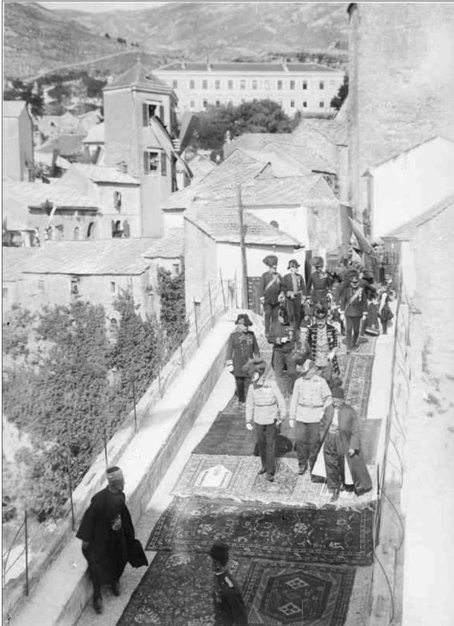
Emperor Francis Joseph on his tour to Bosnia 1910: the Emperor on the Roman Bridge in Mostar