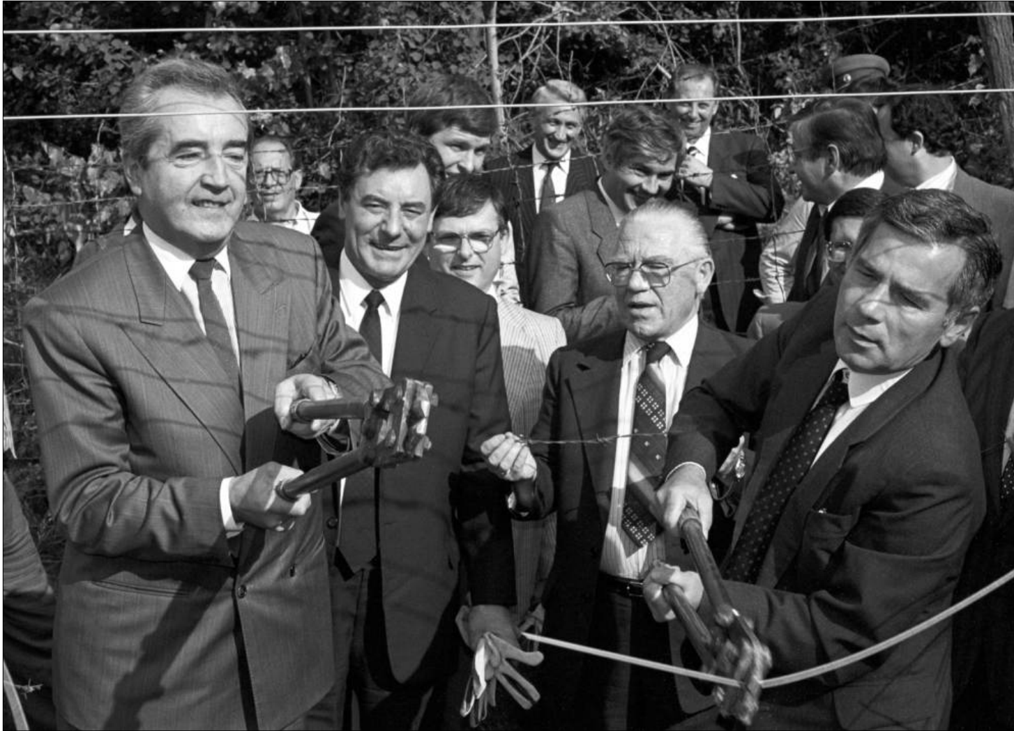
The Austrian foreign minister Alois Mock and his Hungarian ministerial colleague Gyula Horn cut through the Iron Curtain 27.06.1989