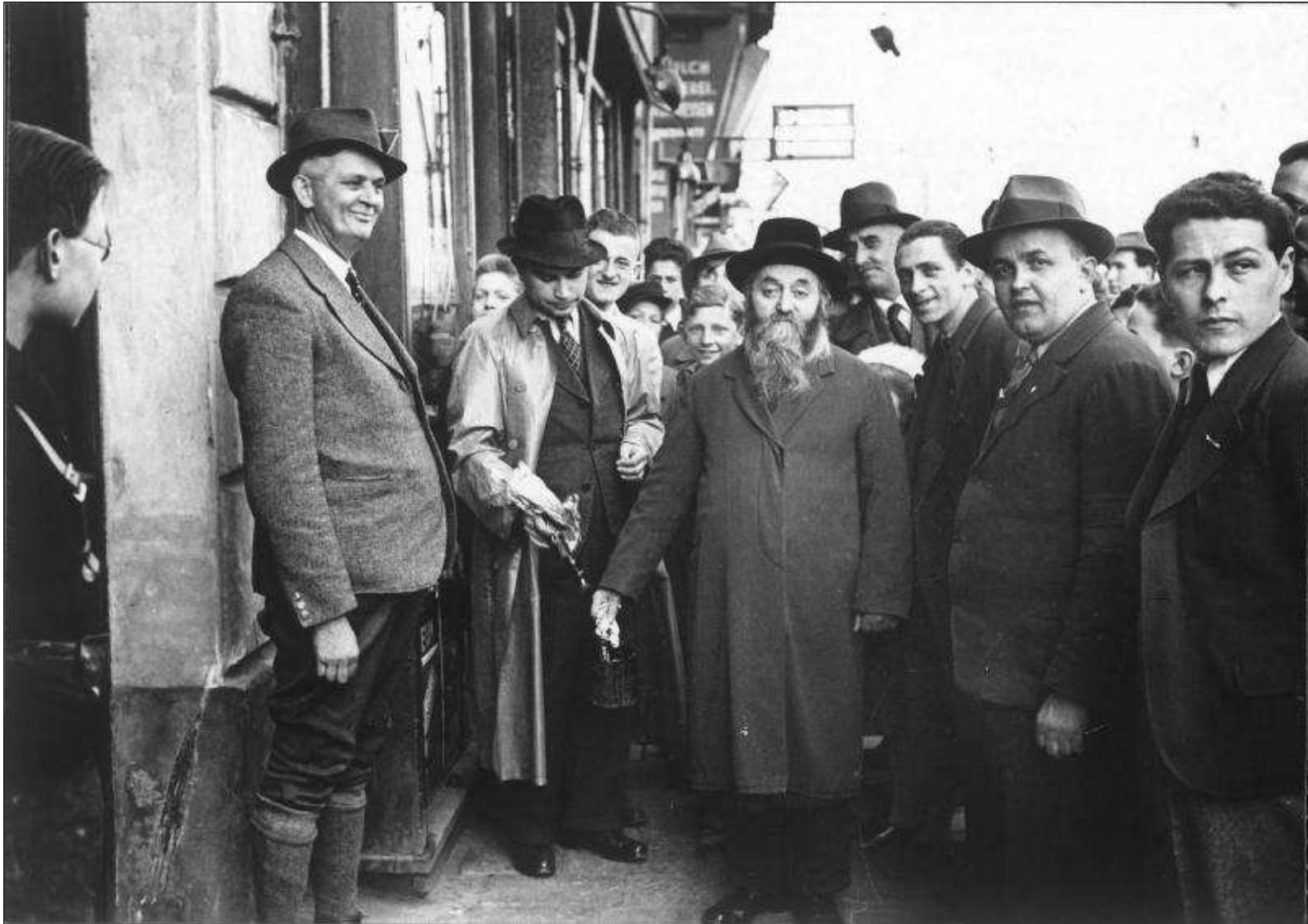
Anti-Semitic riots in Vienna 1938. Jewish men with a paint pot among gaping Viennese March 1938