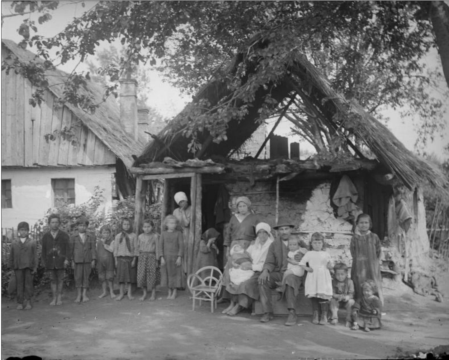
Gypsie's hovel in Dobersdorf (Burgenland). Österreichische Lichtbildstelle ???? Ca. 1925