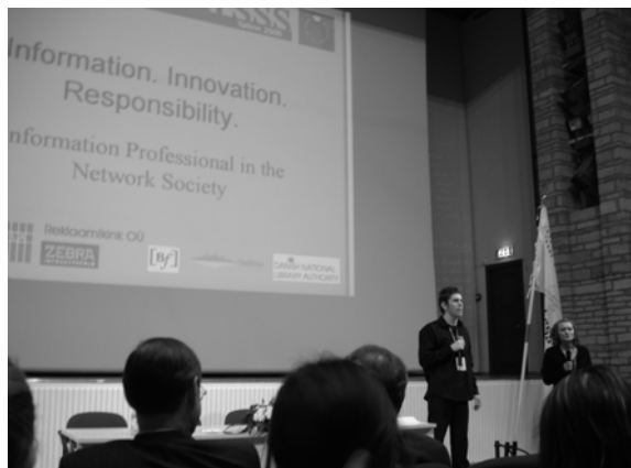
Estonian and Danish student organizers welcome BOBCATSSS participants to the opening ceremony at the National Library of Estonia

In Autumn 2004 when we became involved in this project we knew very little about the challenges we were facing. Participating at BOBCATSSS 2005 in Budapest provided us with some valuable insight. The trip also gave us an opportunity to meet our Estonian co-organizers.