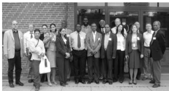
ALA seminar participants