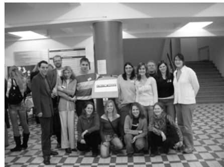
Participants from Potsdam, Germany