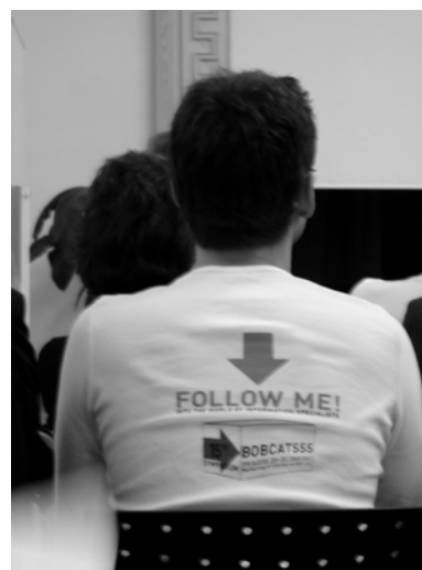
Follow me - BOBCATSSS 2007 in Prague!

Considering that BOBCATSSS is a unique series of symposia that are based on an idea of mutual cooperation between two European LIS schools, let us have a quick look at how one of these events is actually being prepared.