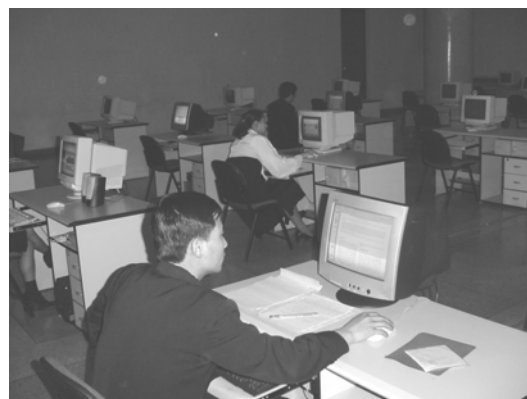
One of the multimedia reading rooms at the Great People Study House

Especially subject #1 “Parties policy” (consisting mainly of lecture + some self study) were a point of discussion figuring out to what extend this subject could include contents of the first of the eight core elements of the IFLA guidelines: “The Information Environment, Information Policy and Ethics, the History of the Field“. Of course we did not expect a complete coverage of the “western” understanding of “policy”. But after a certain discussion the proportion of this topic was reduced considerably while in the same time incorporating a more general understand of the term. The part of information technology and foreign languages are at an adequately high level.