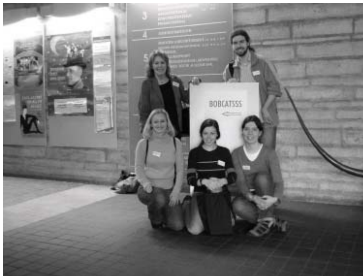
Members of the SET Bulletin Editor Team @ BOBCATSSS Symposium 2006, Tallinn, Estonia

The SET Bulletin Editor Team @ Dept. of Library and Information Science Humboldt Universität Berlin, Germany