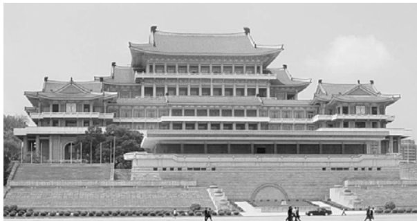
The Great People Study House in Pyongyang (2005)